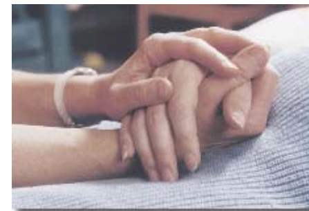
Helping Hands! Caring Heart

We believe, teach, and confess the Triune God, Father, Son, and Holy Spirit – three distinct Persons in one Godhead. Jesus Christ alone is Lord and Savior. The gospel is the power of God for the salvation of all who believe in Him. We believe, teach and confess the Gospel that we are justified by grace alone, that is, by faith alone through Christ alone as the heart and center of the Holy Scriptures, the ecumenical creeds and the Lutheran confessional writings. We believe, teach, and accept the canonical Scriptures of the Old and New Testaments as the sole authoritative source and norm of our proclamation, faith, and life. We accept the Apostles', Nicene, and Athanasian Creeds as true declarations of the scriptures. We believe, teach, and accept the Unaltered Augsburg Confession and the Small Catechism as true witnesses to the Word of God, normative for our teaching and practice. We believe, teach, and accept the other confessional writings in the Book of Concord, namely, the Apology of the Augsburg Confession, the Smalcald Articles, the Treatise, the Large Catechism, and the Formula of Concord, as further valid expositions of the Holy Scriptures.